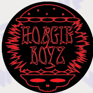
513 Osborne St